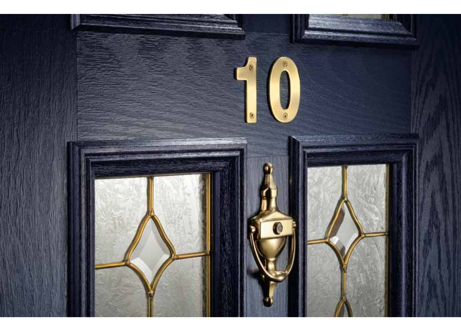
Homeowner Care Guide